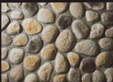
Brown River Rock