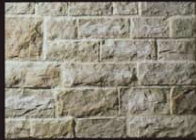
Ohio Vintage Limestone White mortar/brown sand