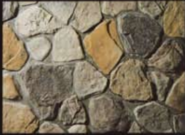
Top Rock Fieldstone