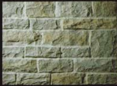
Tan Limestone White mortar/brown sand