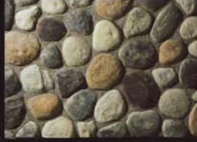
Michigan River Rock