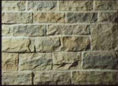
Sandusky Shore Limestone White mortar/brown sand