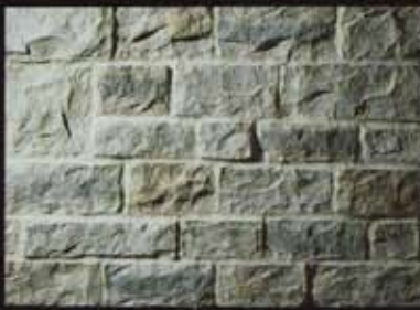
Shoreline Limestone White mortar/brown sand