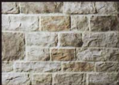
Nantucket Limestone White mortar/brown sand

Stone veneer featured in cover photo: Tan Limestone