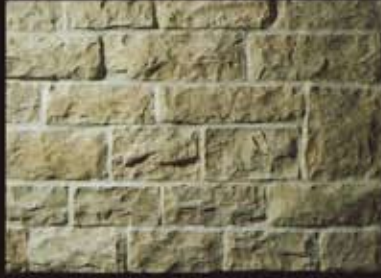
Buff Limestone White mortar/brown sand