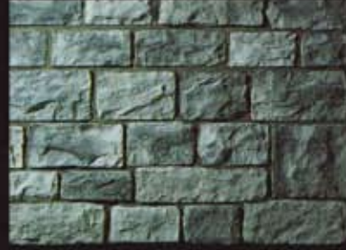
Blue Ridge Limestone