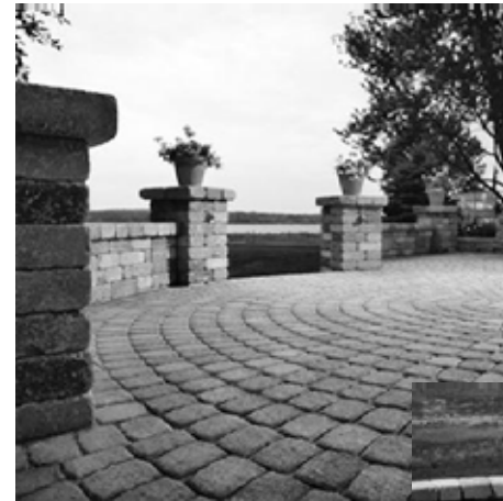
Image(left): Washington Circle installation with Edington columns and walls in a running bond pattern