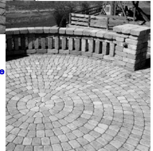
Image(above): Washington Circle installation with Edington columns and walls in a vertical pattern